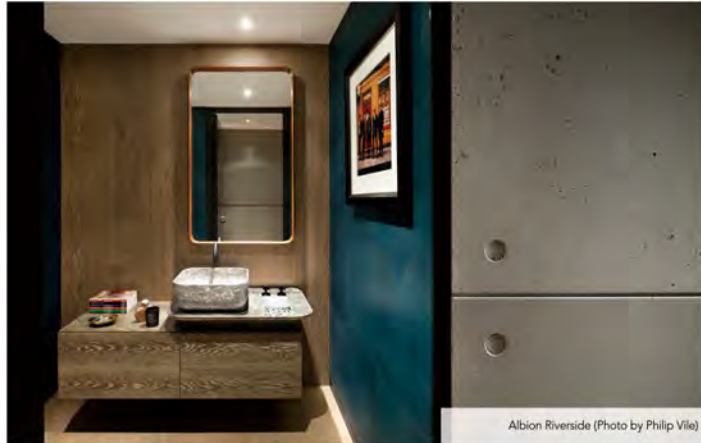
Albion Riverside