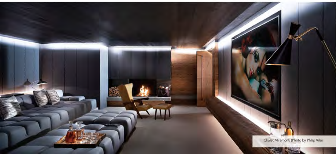
Chalet Miramonti