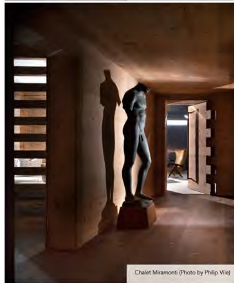
Chalet Miramonti