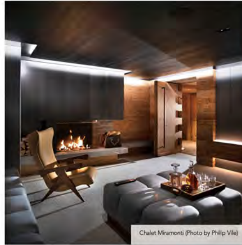
Chalet Miramonti

Bernerd explains, "For me, the most important aspect of design is seeking components that are authentic and will stand true in time. I don't tend to follow trends and strive to create spaces that are indigenous to their surroundings. However, there is a definite thread that runs through our work that links them all on an aesthetic level. Perhaps it's a slightly more handsome feel, or the fact that we tend to incorporate raw, more architectural materials within our work."