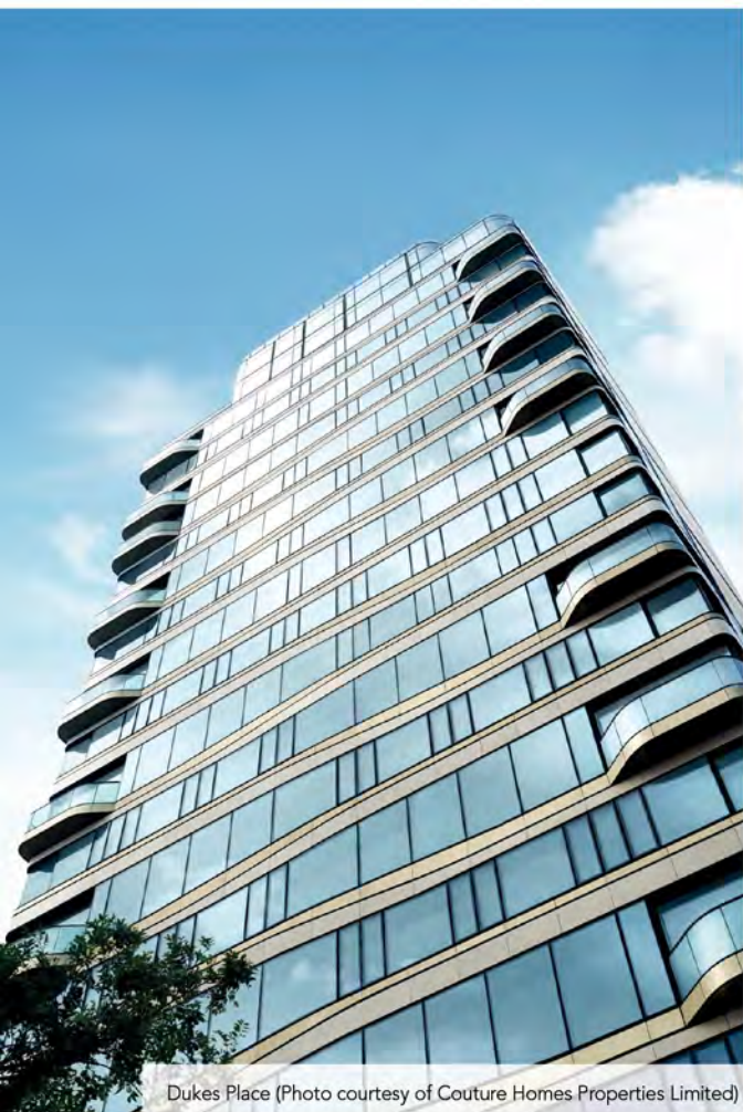
Dukes Place