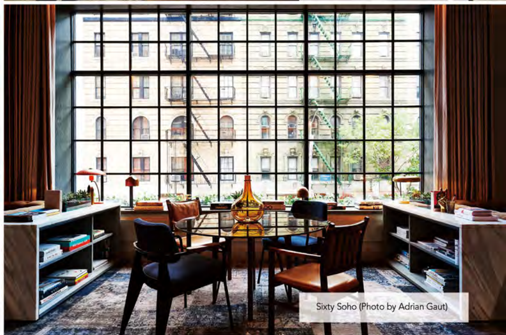
Sixty Soho

"We then selected a rich palette of bold colours and layered the most luxurious materials, such as light stones and Italian marbles, with more relaxed timbers and glossy lacquers. The highest quality Italian furniture was selected to complete and enhance the space to deliver both a functional home and a stand-out example of luxury living," continues Bernerd.