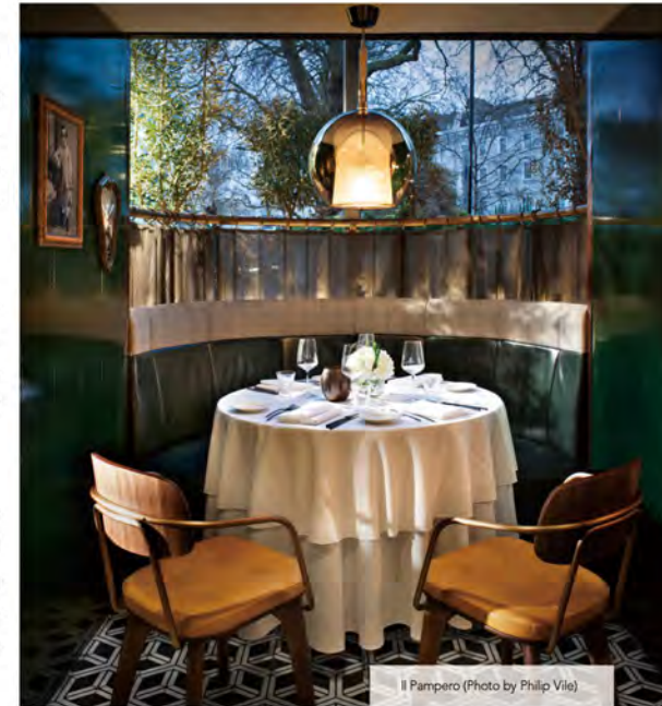
Il Pampero

Clearly proud of the work, the designer enthuses, "Initially we were inspired by both the architecture of the building itself and the exclusive location in which it is set, so we wanted to bring both of these elements into the design. The curved language of the building was integrated into the space planning and interior architecture to create a seamless internal flow of spaces."