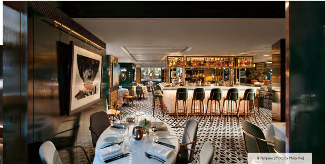
Il Pampero